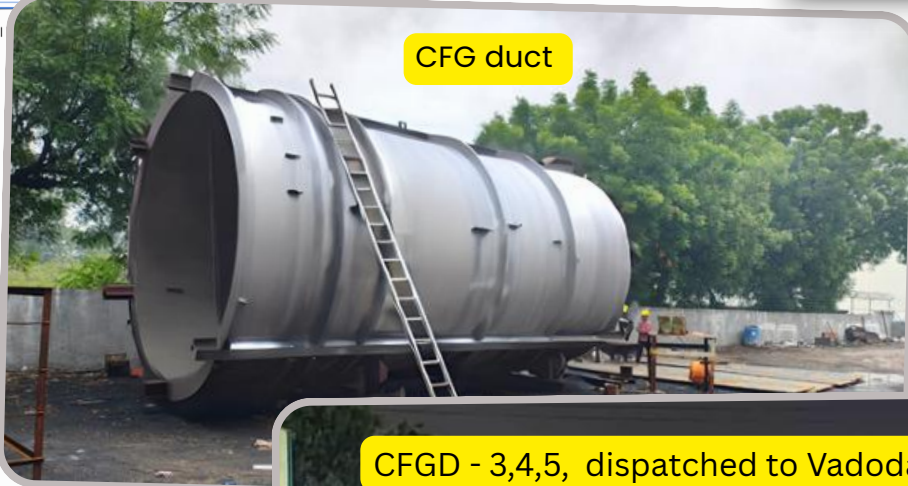
CFGD - 3,4,5, dispatched to Vadodara site