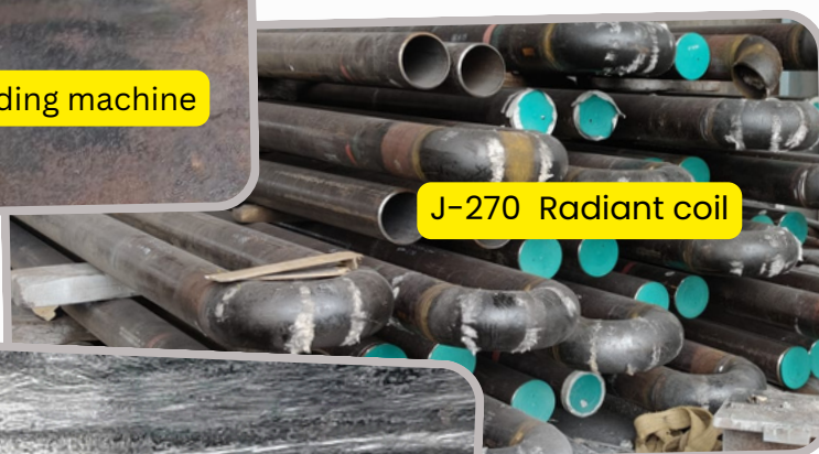
J-270 Radiant coil