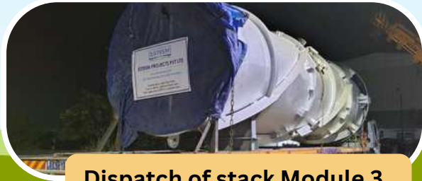
Dispatch of stack Module 3 to 251 site from EGW