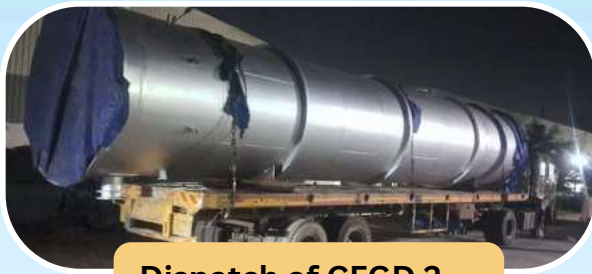
Dispatch of CFGD 2 to 251 site from EGW