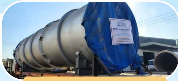
Dispatch of stack Module 2 to 251 site from EGW