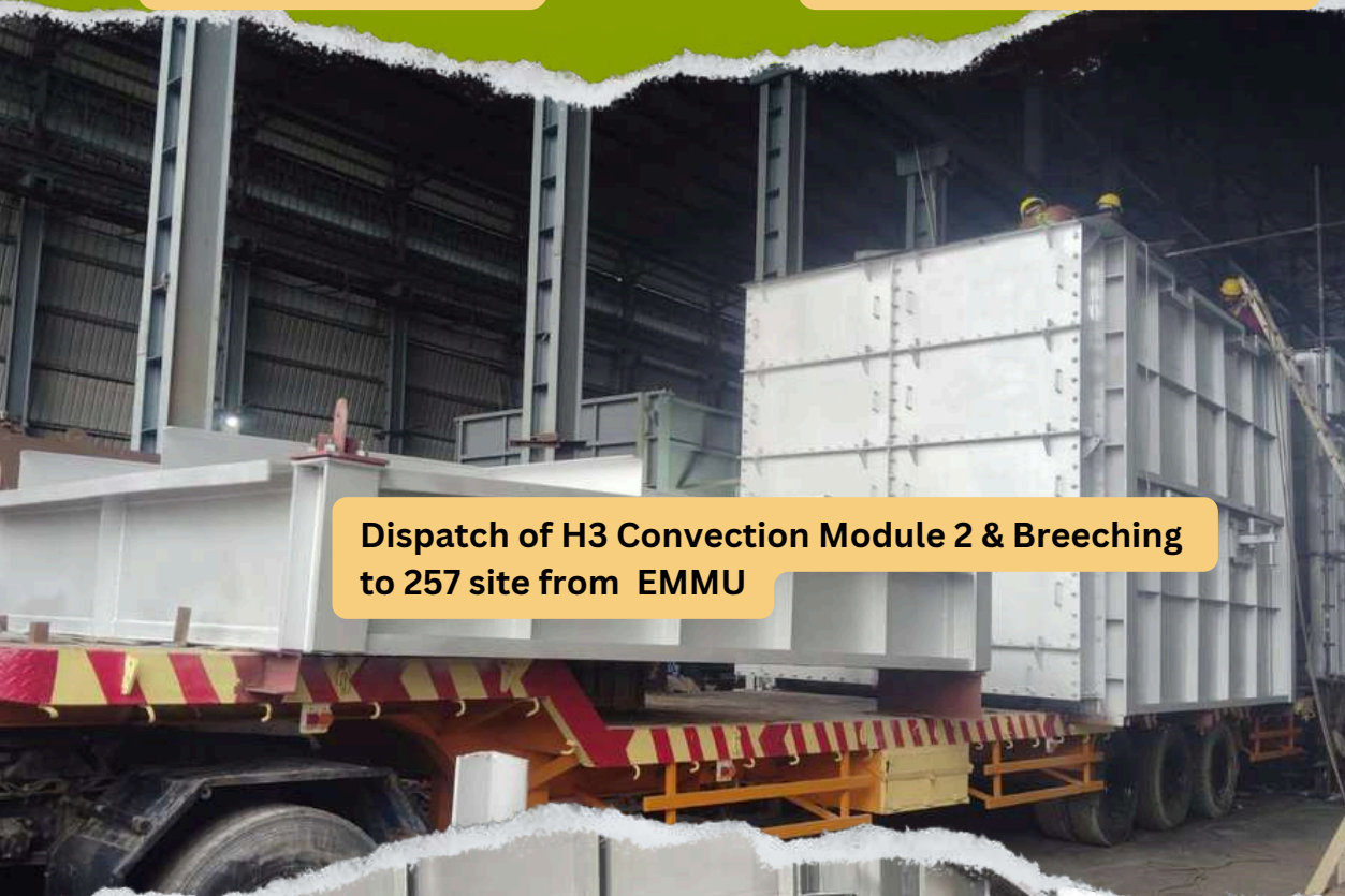
Dispatch of H3 Convection Module 2 & Breeching to 257 site from EMMU