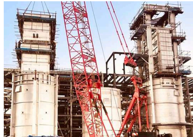
Job No. 245