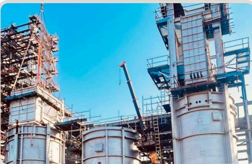
Job No. 257