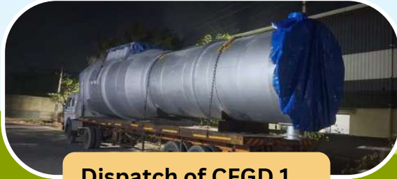
Dispatch of CFGD 1 to 251 site from EGW